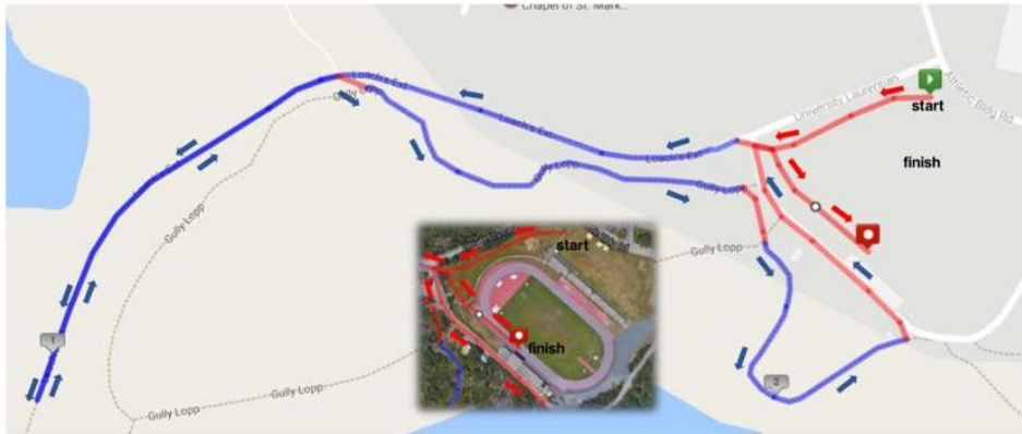
2.5km course map