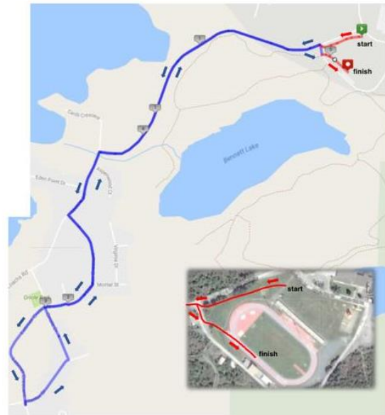
5km course map